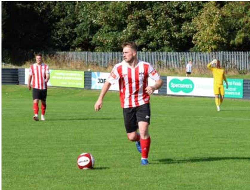
Saturday 28th September Liversedge 4 v Newton Aycliffe 0