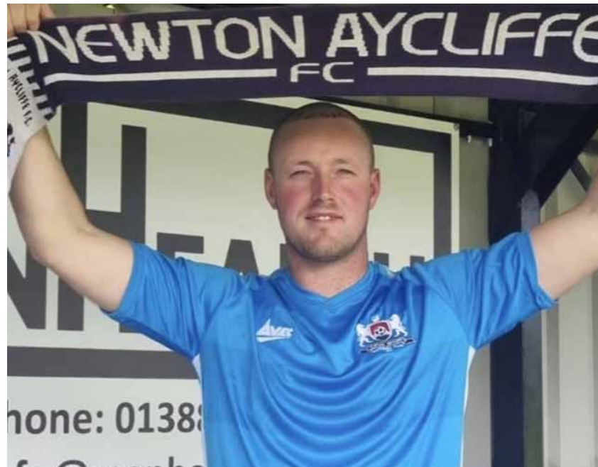
Emley 0 v Newton Aycliffe 3 Isuzu FA Trophy, Second Qualifying Round Saturday 21st September