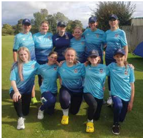
in the 100 cup semi-final at home to Whitby.