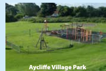
Aycliffe Village Park