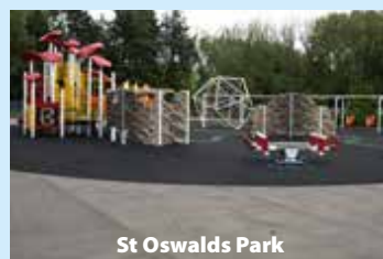
St Oswalds Park