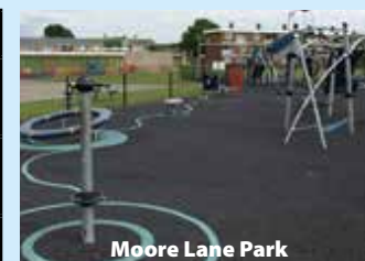
Moore Lane Park