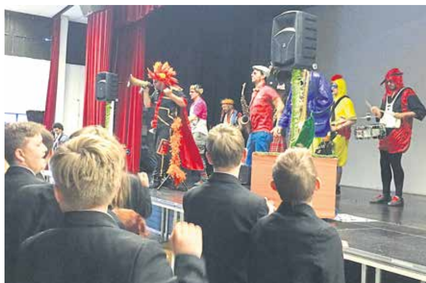
Greenfield Arts are thrilled

to once again be part of the Brass Festival which will be coming to the region between 7th-16th July 2017. This year the event has once again attracted quality acts who will be performing throughout the North-East and bringing their special flavour of street brass to various venues.