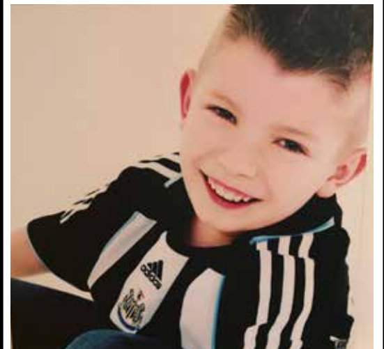
Happy 18th Birthday 5 July 2017