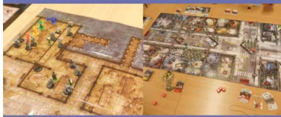
Table Top Newton Aycliffe

Meet at Woodham Community Centre St Elizabeth's Close, Woodham, Newton Aycliffe DL5 4UE