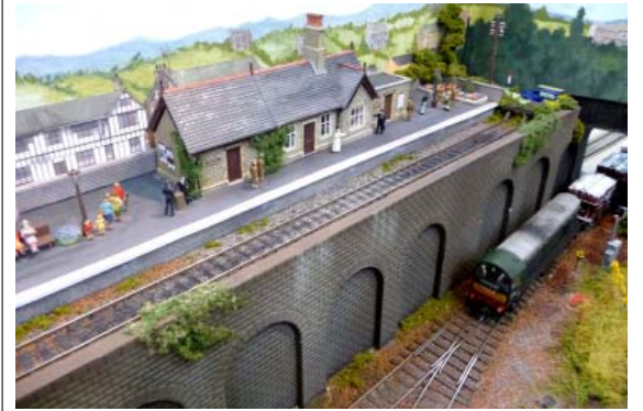
One of the many Model Railway layouts to be exhibited

Following on from the recent fantastic experience of the gathering of "Mallard" and her 5 surviving sisters at Locomotion Shildon the next event for railway enthusiasts in Newton Aycliffe is the fifth annual Model Railway Exhibition organised by the town's Rotary Club on 5th April 2014, from 10am to 5pm at the Youth Centre, Burn Lane.