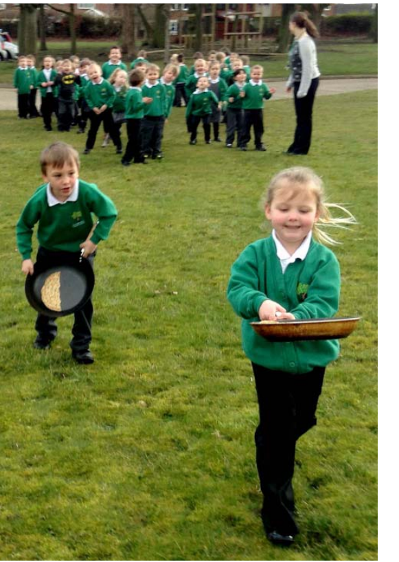
Reception children at Sugar Hill Primary School enjoyed celebrating Shrove Tuesday with a variety of activities. The boys and girls helped to make pancakes and certainly enjoyed eating them! After reading the story 'Mr Wolf's Pancakes' they had fun going out into the sunshine and participating in a Pancake Race. The two classes raced against each other and flipped the pancake as they ran.